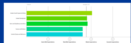
Communication Effectiveness (Writing) Assessed Spring 2022