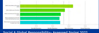
Social & Global Responsibility- Assessed Spring 2022