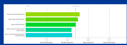
Critical Thinking- Assessed Spring 2023