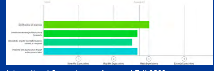
Intercultural Competence- Assessed Fall 2022