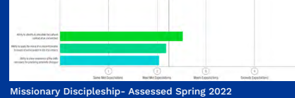
Missionary Discipleship- Assessed Spring 2022