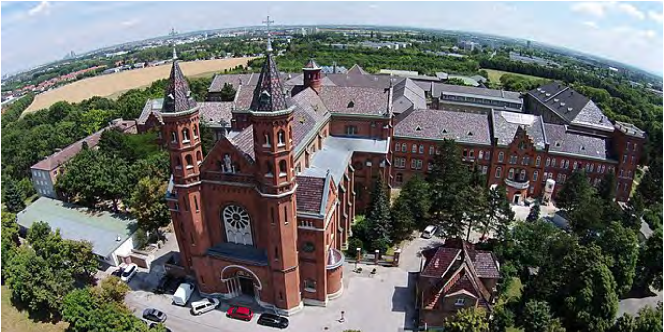
St. Gabriel's Mission House in Vienna, Austria.

Society is all the more remarkable when compared with the views prevalent in his cultural milieu.